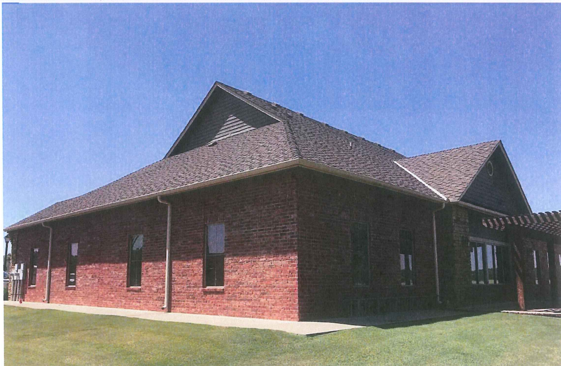
Photo Two Caption Southeast Corner of the building looking Northwest.

Photo One Caption Northwest Corner of the building looking Southeast.